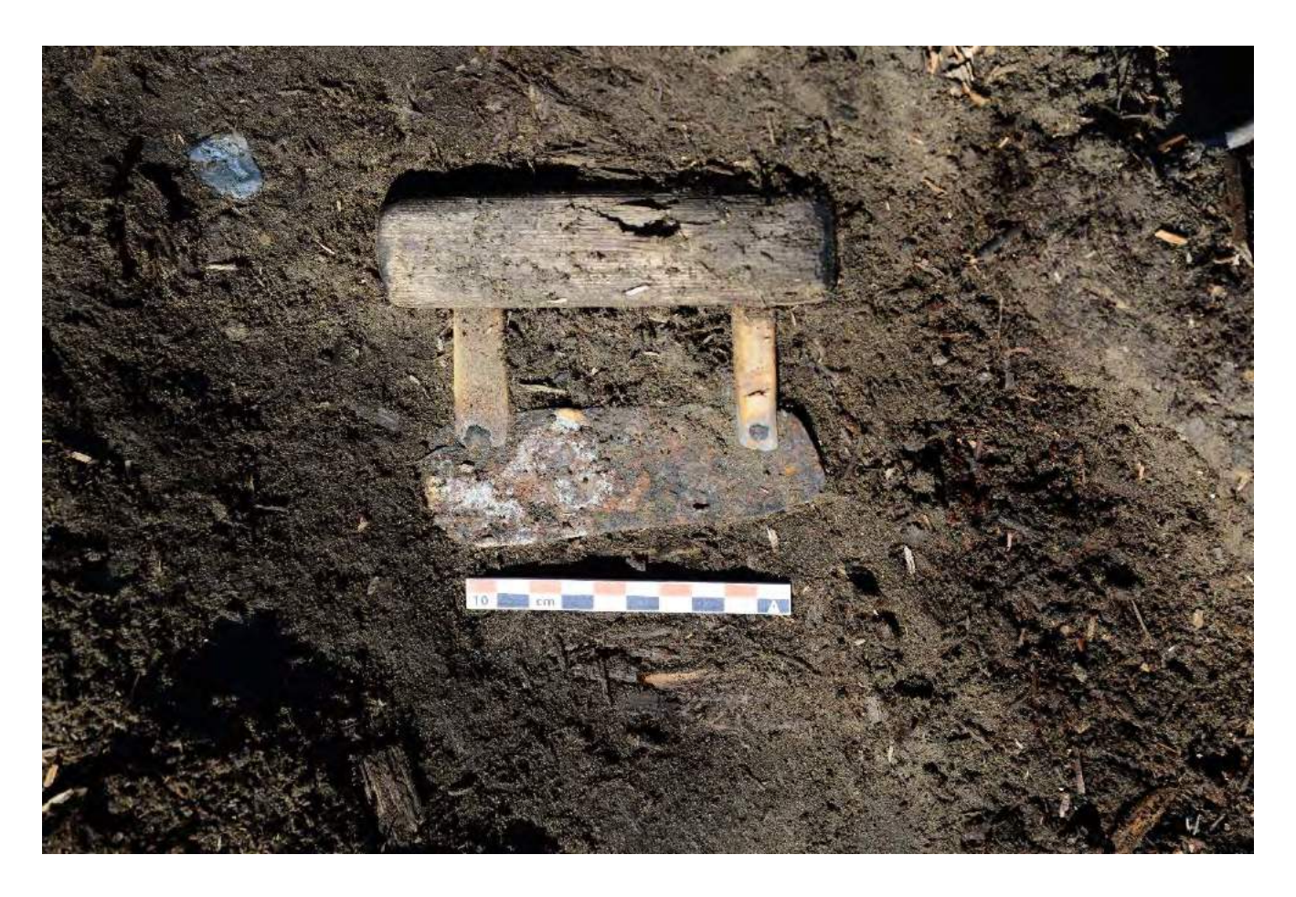
Our favourite artifact – an ulu with a wooden handle, two antler tangs, and an iron blade.