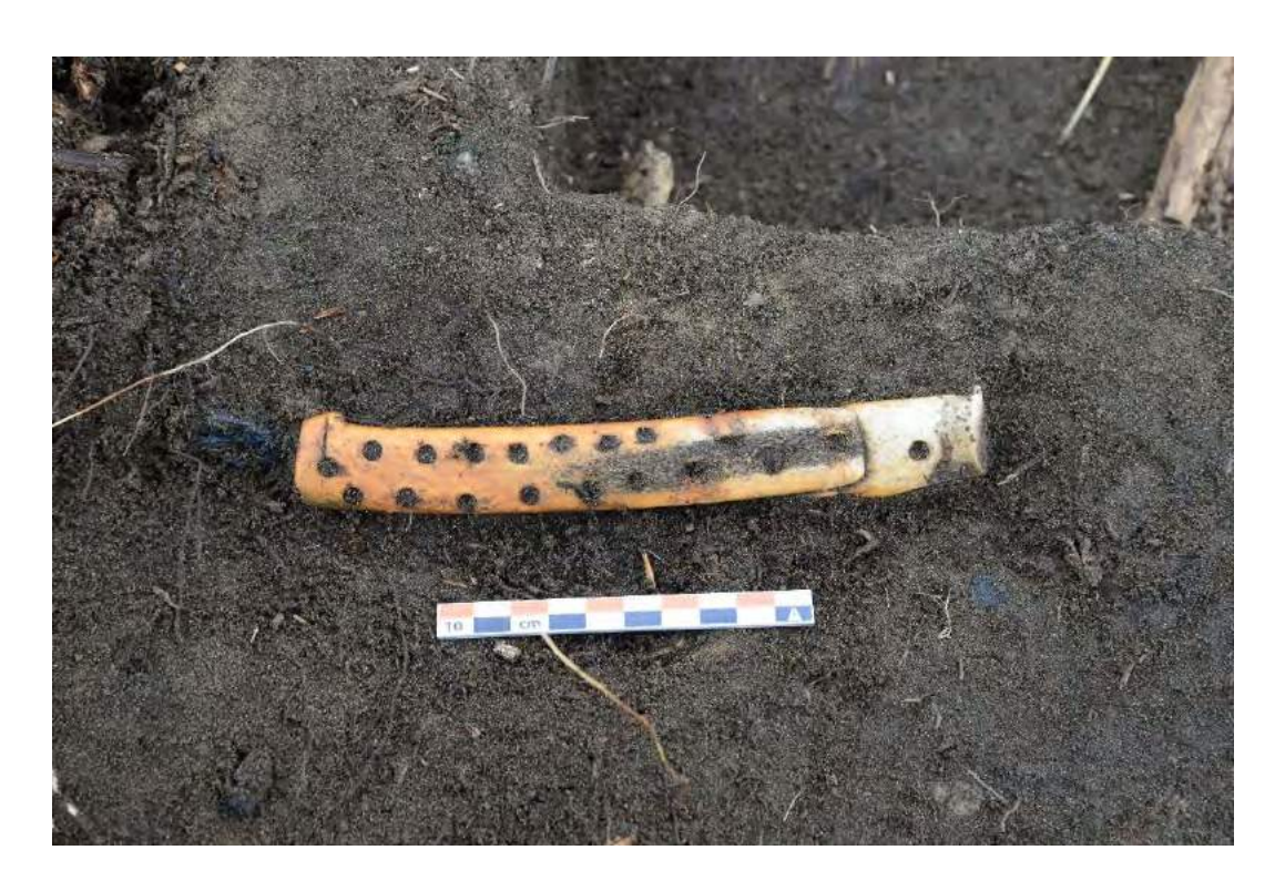
A two-part knife handle made of caribou antler.