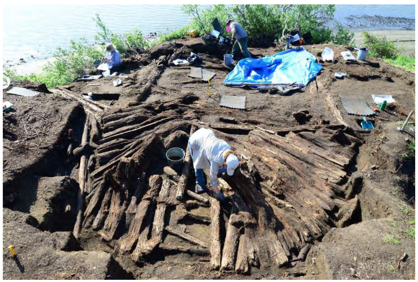
After about two weeks, we could see the amazingly well-preserved collapsed walls of the house. Here, you can see the side and rear walls of the rear alcove, all collapsed down in a regular pattern.

Because Kuukpak is so large, it has been divided into six areas, most of which contain several houses. Almost all of our 2017 work was on House 1 in Area 5, which turned out to be the largest ancient Inuvialuit house ever excavated. Following are several photos showing different stages of the excavation.