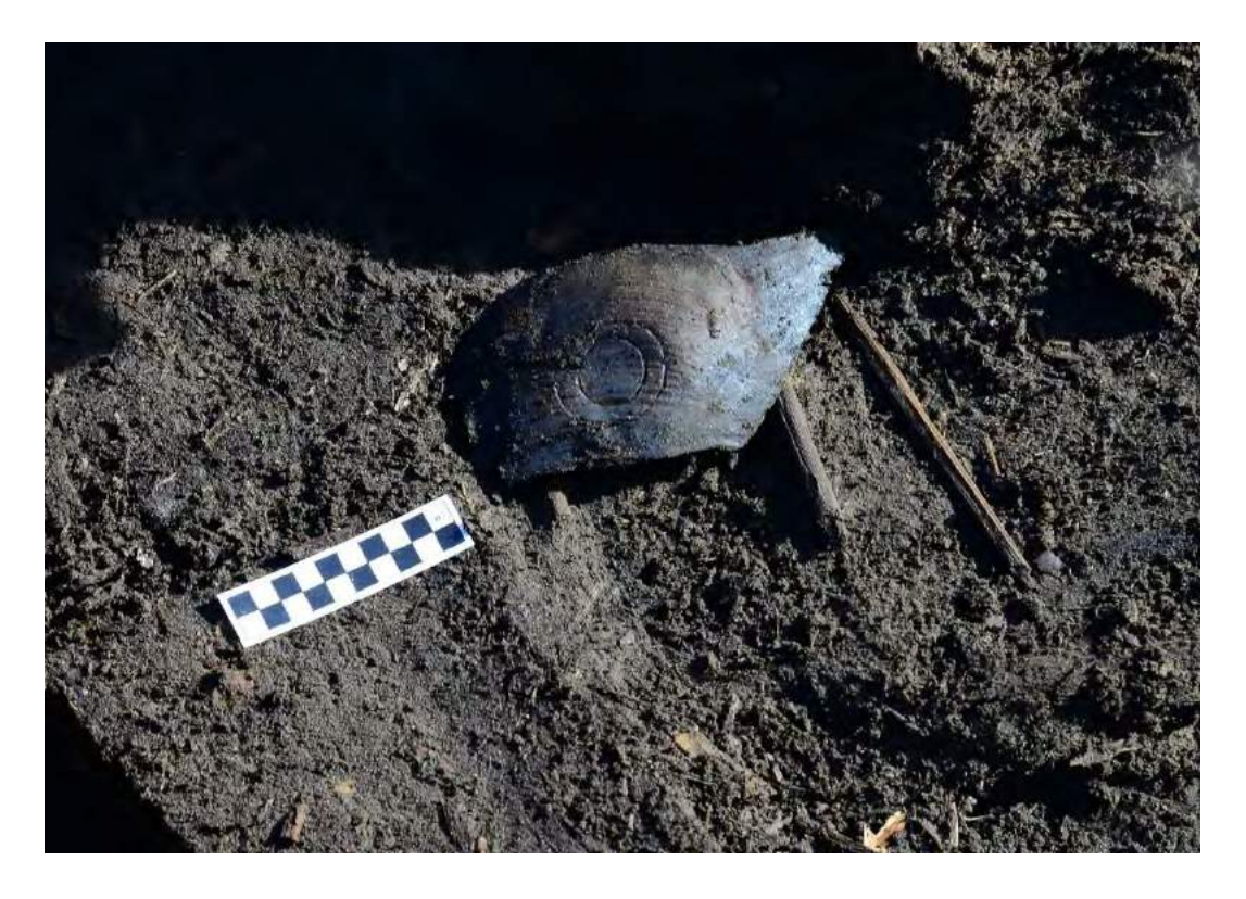
Part of a wooden artifact – possibly a bowl – with a very precisely-made double circle design.