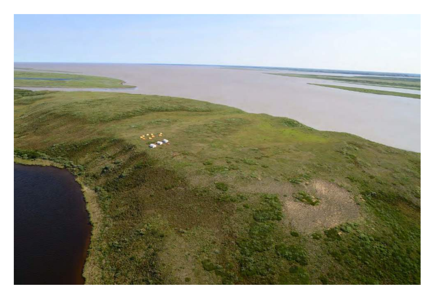
The 2017 camp at Kuukpak. The yellow sleeping tents are surrounded by an electric bear alarm fence. The three white tents are the cook tent, storage tent, and artifact tent where all artifacts are carefully cleaned and packed. The main site of Kuukpak is on the slopes down to the water's edge at upper right.