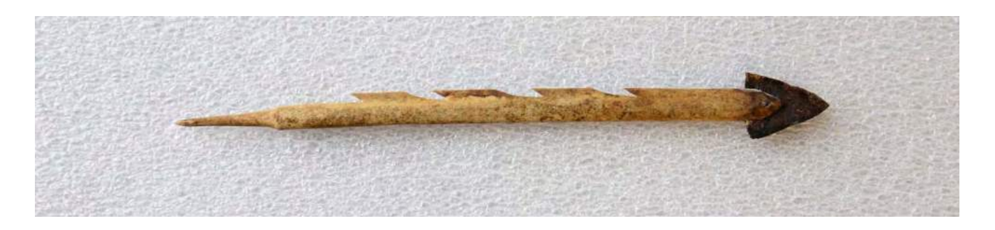
An antler arrowhead with an iron blade, indicating that Inuvialuit had begun to trade for useful European materials in the mid-1800s.