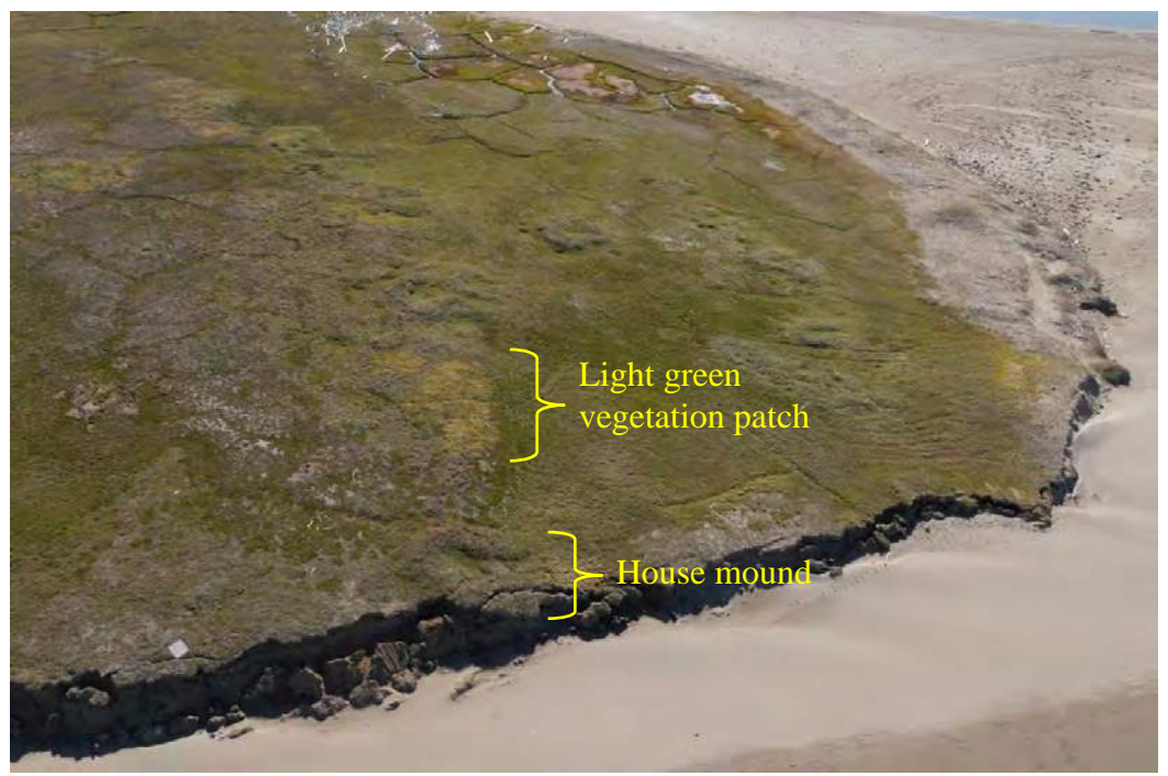
McKinley Bay in 2013. Note the light green vegetation patch in centre of photo, and the complete house mound below it.

The McKinley Bay site near the northeast end of the Tuktoyaktuk Peninsula is eroding rapidly. Below, a comparison of 2013 and 2017 air photos shows that an entire house has eroded in the last four years.