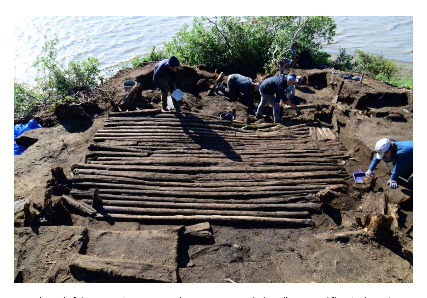
Near the end of the excavation, we came down to a spectacularly well-preserved floor in the main room. The remains of four posts that held up the roof can be seen at each corner.