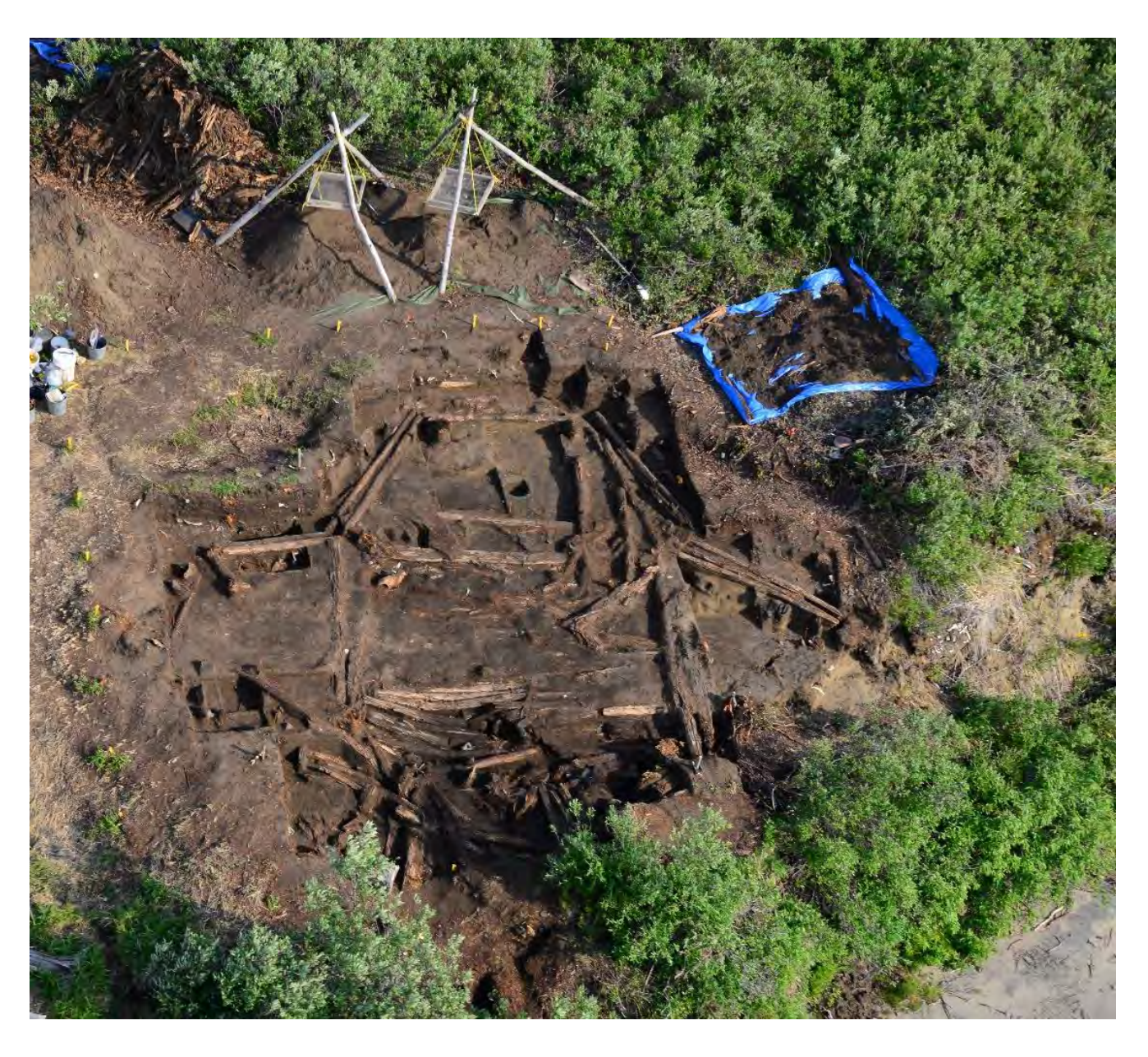
An air photo of the house nearing the end of excavation. The overall shape of the house can be clearly seen of a central square floor area with three alcoves – two on each side, and one at the back. The alcove on the right is eroding down the slope. The large dark pit at the bottom of the photo is the entrance area. It was badly slumped and eroded.