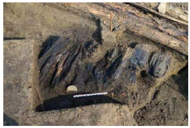
One of the side alcoves was destroyed by fire and rebuilt at least once. Here is part of an earlier collapsed wall that is heavily burnt.