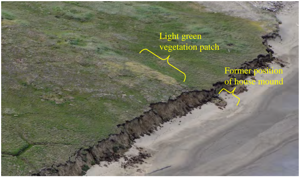
McKinley Bay in 2017. The light green vegetation patch is now at the edge of the eroding bluff, and the house mound is completely gone. In just four years, an entire house has been destroyed, and the bluff continues to erode back towards other houses.